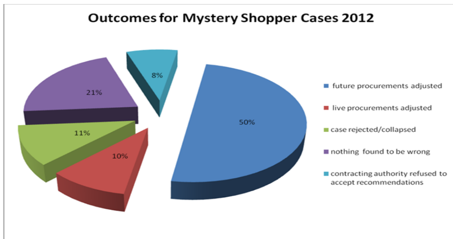
Diagram 3 – Breakdown of Mystery Shopper interventions

Mystery Shopper: The Mystery Shopper team have now received over 440 cases, with over 80% being resolved with a positive outcome. Diagram 3 shows how our interventions have seen significant changes to procurement practices and accounting processes.