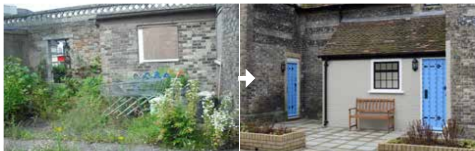
BEFORE AND AFTER: THE BUILDINGS ARE BARELY RECOGNISABLE FROM THE CRUMBLING, EMPTY SHELLS THEY HAD BECOME. INSIDE, KITCHENS AND BATHROOMS HAVE BEEN REVAMPED WITH NEW FLOORING AND FITTINGS