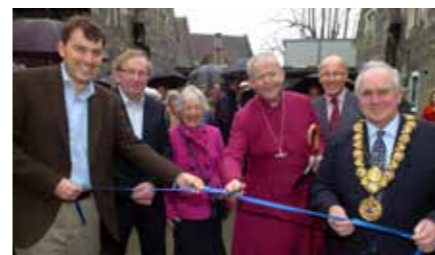
THE OPENING OF THE FLATS AT ST PAUL'S GIVES PREVIOUSLY HOMELESS PEOPLE A NEW START