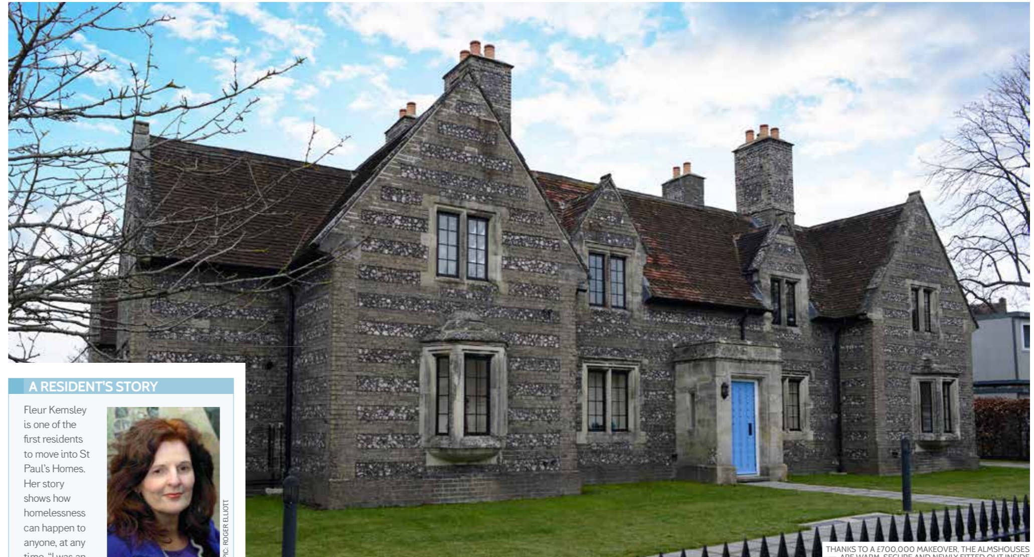
THANKS TO A £700,000 MAKEOVER, THE ALMSHOUSES ARE WARM, SECURE AND NEWLY FITTED OUT INSIDE

"We wanted to restore these flats at St Paul's and create a community where conditions enable