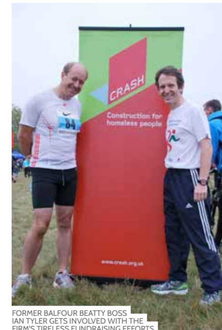
FORMER BALFOUR BEATTY BOSS IAN TYLER GETS INVOLVED WITH THE FIRM'S TIRELESS FUNDRAISING EFFORTS

Homelessness is not just an inner-city issue. This year we supported the renovation of a night shelter in Winchester, which offers two types of accommodation – 'crash beds' where homeless people can stay for up to 14 days and 'full support beds' offering longer term shelter. We gave professional expertise free of charge as well as making a donation. Winchester Churches, which now runs the shelter, offers an essential lifeline where basic needs of shelter, food and hygiene can be met, but it also offers other vital help in easing loneliness, providing a secure support network to address problems and a stepping stone to being included in society.