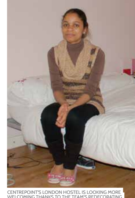
CENTREPOINT'S LONDON HOSTEL IS LOOKING MORE WELCOMING THANKS TO THE TEAM'S REDECORATING