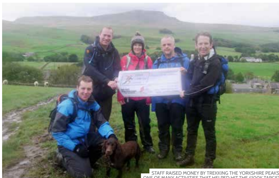
STAFF RAISED MONEY BY TREKKING THE YORKSHIRE PEAKS, ONE OF MANY ACTIVITIES THAT HELPED HIT THE £100K TARGET