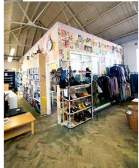
EMMAUS PROVIDES COMPANIONS WITH A WELL-STOCKED SHOP TO BUY EVERYTHING FROM BEDS TO CLOTHES