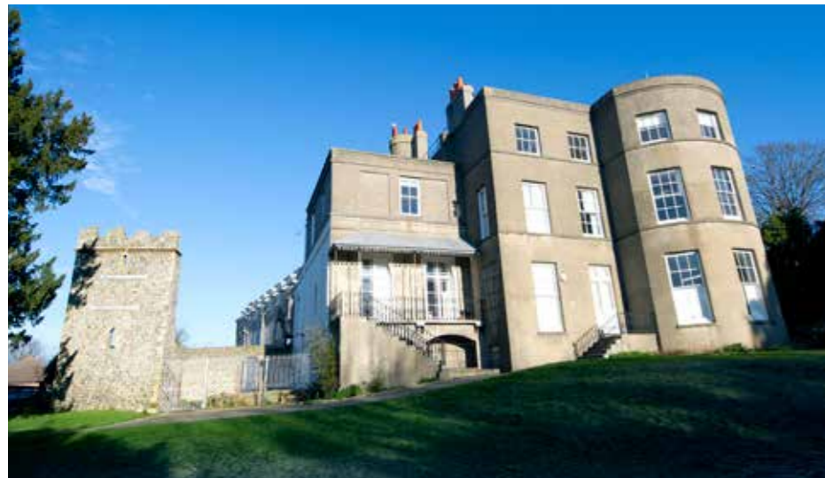
PREVIOUSLY HOMELESS PEOPLE CAN MAKE A NEW START AT EMMAUS, SIGNING OFF BENEFITS AND WORKING IN THE COMMUNITY