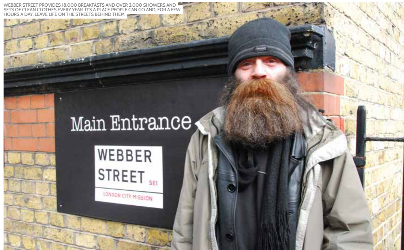
WEBBER STREET PROVIDES 18,000 BREAKFASTS AND OVER 2,000 SHOWERS AND SETS OF CLEAN CLOTHES EVERY YEAR. IT'S A PLACE PEOPLE CAN GO AND, FOR A FEW HOURS A DAY, LEAVE LIFE ON THE STREETS BEHIND THEM