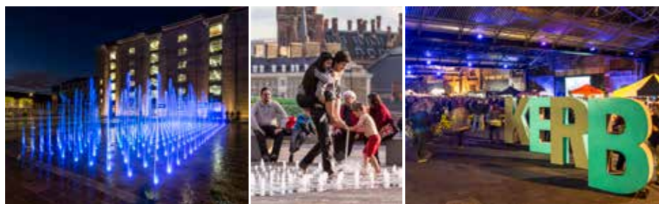
THE NEW KING'S CROSS WILL INCLUDE 26 ACRES OF PUBLIC SPACE, DESIGNED WITH THE LOCAL COMMUNITY FIRMLY IN MIND