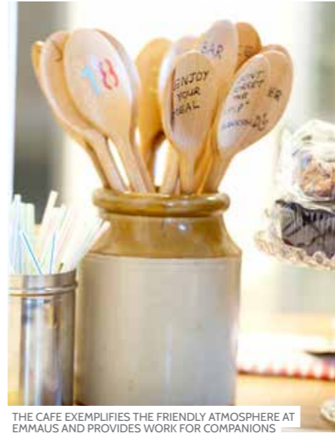
THE CAFE EXEMPLIFIES THE FRIENDLY ATMOSPHERE AT EMMAUS AND PROVIDES WORK FOR COMPANIONS