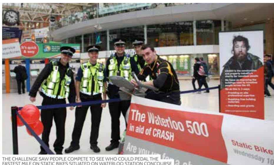
THE CHALLENGE SAW PEOPLE COMPETE TO SEE WHO COULD PEDAL THE FASTEST MILE ON STATIC BIKES SITUATED ON WATERLOO STATION CONCOURSE