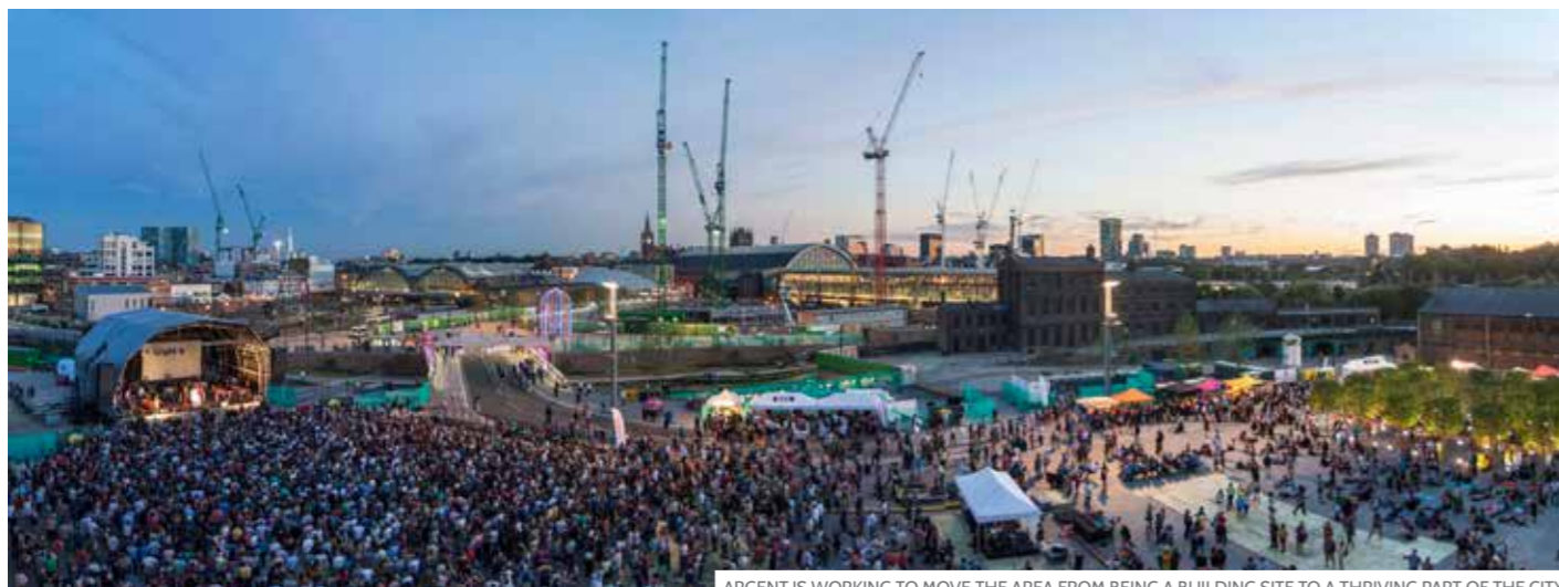
ARGENT IS WORKING TO MOVE THE AREA FROM BEING A BUILDING SITE TO A THRIVING PART OF THE CITY