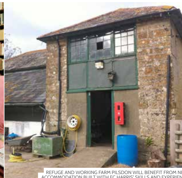
REFUGE AND WORKING FARM PILSDON WILL BENEFIT FROM NEW ACCOMMODATION BUILT WITH EC HARRIS' SKILLS AND EXPERIENCE