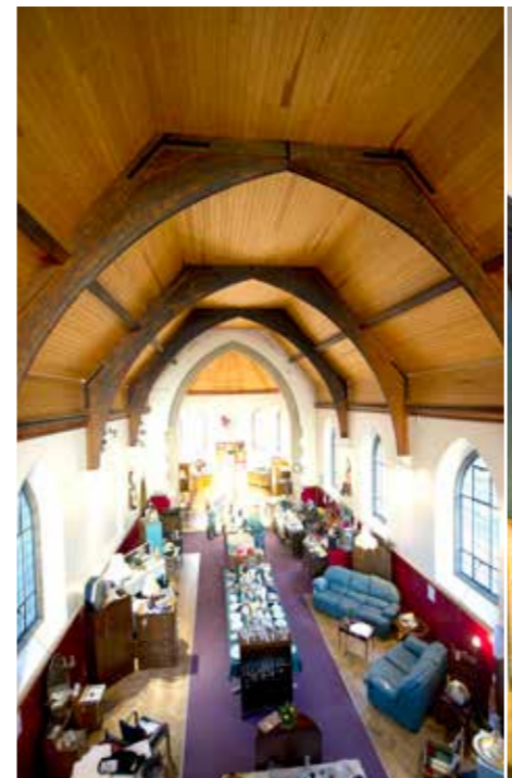
THE COMMUNITY'S EMPORIUM HOUSES SOUGHT-AFTER VINTAGE GOODS RENOVATED BY COMPANIONS