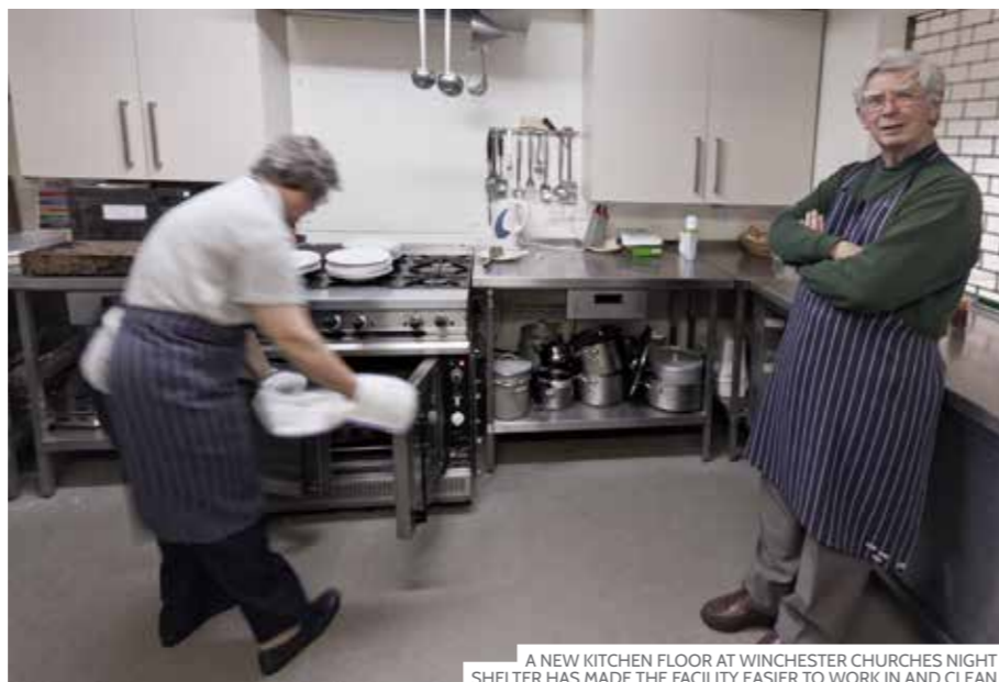
A NEW KITCHEN FLOOR AT WINCHESTER CHURCHES NIGHT SHELTER HAS MADE THE FACILITY EASIER TO WORK IN AND CLEAN

The Sheffield Jesus Centre moved into the former Methodist Hanover Centre in Broomhall in 2011 and as part of the preparations for the building's new use, Altro supplied its Altro