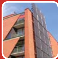
Solar tubes on apartment block generating hot water

Renewable energy comes from sources that can be replenished, such as the sun. Renewable energy can be generated at the home, reducing the amount of energy required from fossil fuels.