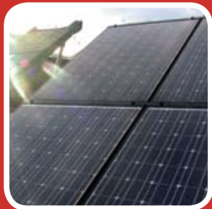
Solar panel generating electricity from the sun

Using grid electricity and gas releases carbon dioxide (CO 2 ) into the atmosphere. CO 2 is a harmful greenhouse gas and a major contributor to climate change.