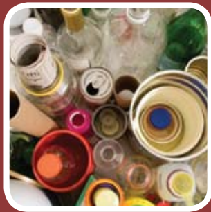
Separating recyclables from waste

The rubbish we throw away is a valuable resource. Over 80% of our waste can be reused or recycled and a lot of it didn't even need to be created in the first place!