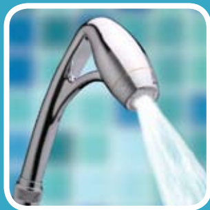
Oxygenics Body Spa low-flow shower

A growing population, lifestyle choices and changing weather patterns mean that water shortages are becoming a very real threat in the UK.