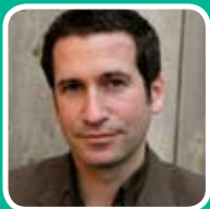
OLIVER HEATH, TV PRESENTER AND DESIGNER

Buying a new home is one of the most stressful and expensive times in our life! However, it provides an ideal opportunity to ensure that your future home will be a sound investment for the future and help you achieve a better quality of life.